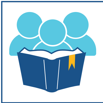
A) Peer-Reviewed Articles