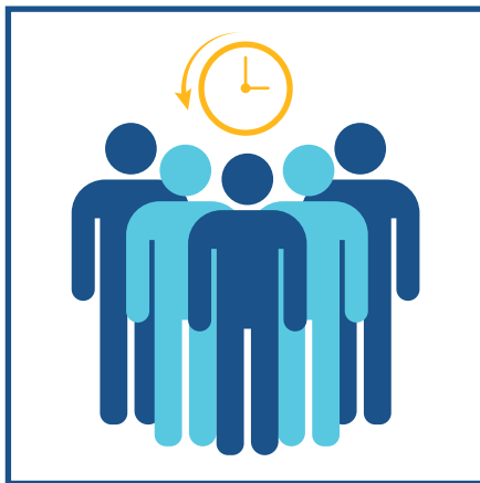
D) Retrospective Studies